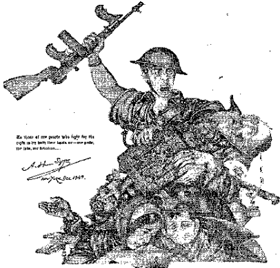
Do some of the people who fight for the right to die with their hands on their hips, for the sake of the world...

Daily, hourly, the greatest crime of all time is being committed: a defenseless and innocent people is being slaughtered in a wholesale massacre of millions. What is more tragic—they are dying for no reason or purpose.